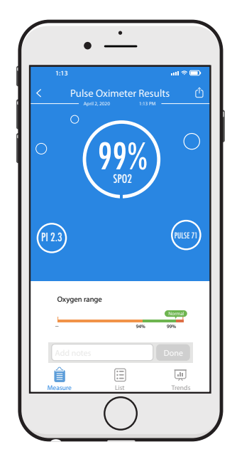
Figure 5. Summary of results in the app