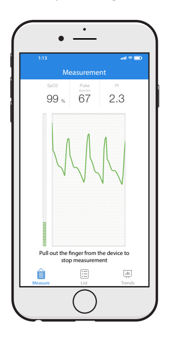
Figure 4. Results in the app