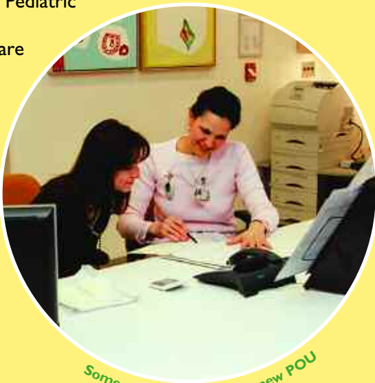
Some of the nurses in our new POU

The Laura Rosenberg Pediatric Observation Unit is a place where patients are admitted when they need extra-special medical attention. The POU (as in Winnie the...) is a three-bed unit located between the inpatient and outpatient units. Patients staying here have the best care anywhere.