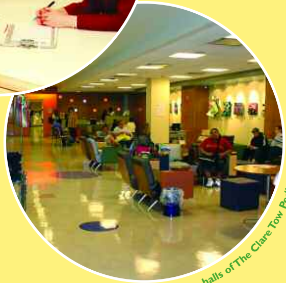
The halls of The Claire Tow Pediatric Day Hospital