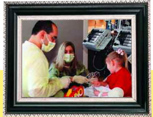
Playing UNO in Isolation