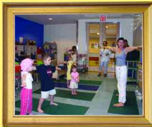
Stretching it out in Kids' Yoga

Right in the middle of our new units is the magnificent Recreation Center . It is fantastic! There's always something to do and every corner of the room has a different activity, from video games and arts and crafts, to just hanging out and watching a movie on the big plasma screen TV. And we get to do it all surrounded by the wonderful smells of brownies or cookies baking in our very own kitchen! The skylight and Feature Wall keep the light constantly changing, so no matter where you are in the Center, you feel the magic everywhere.