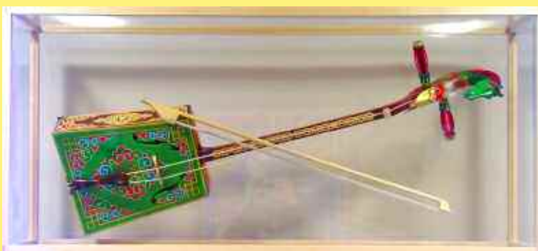
An antique mandolin floating overhead in the Family Lounge

Cheerful interpretations of children's artwork welcome people to our Inpatient Unit and the POU.