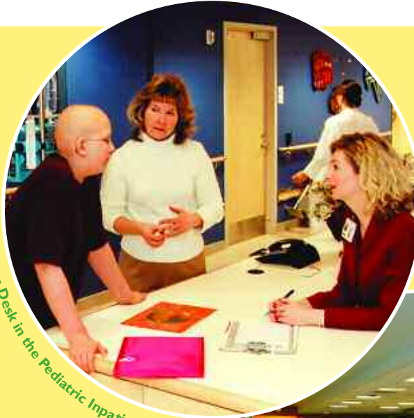
Reception Desk in the Pediatric Inpatient Unit

Lots of windows and colors welcome patients and family members when admissions to the hospital are required. Each room has been specially designed to provide separate spaces for the patient, family members or visitors, and the clinical staff.