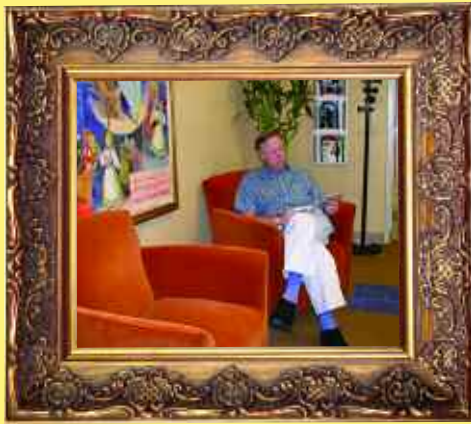
Using the Family Lounge to relax

Beyond the activity room you enter the living room area, or Family Lounge. The walls are covered in soothing, rich colors. Soft carpet and comfy furniture add to this peaceful room, where families and visitors can talk, read, rest, and be together.