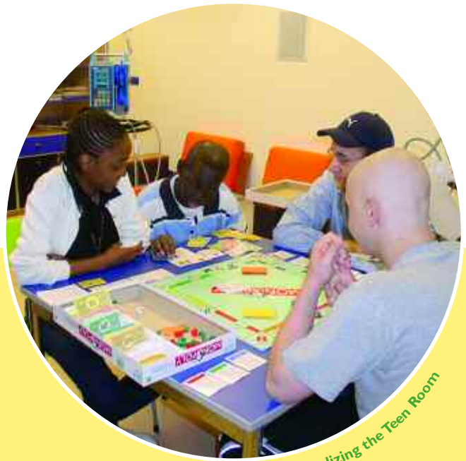
Monopolizing the Teen Room