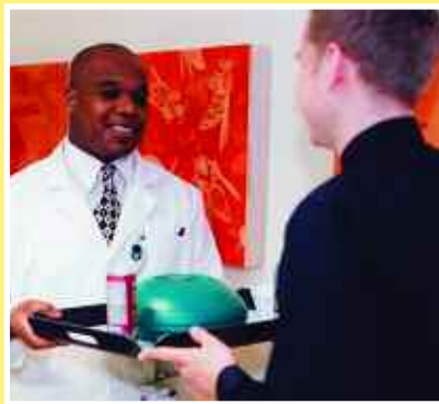
Handing off Room Service

And speaking of food... families staying inpatient, or patients receiving treatment in the PDH Bed Area, can order their favorite food from the dining menu and it will be delivered right to their beds. You can preview the menu on the PDH touch-screen, too!