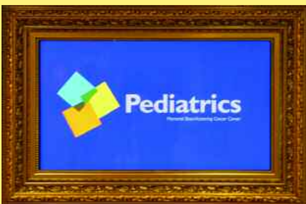
Welcome Wall Screen

Welcoming patients to the treatment areas are magic little lights called LEDs (light emitting diodes) that keep changing