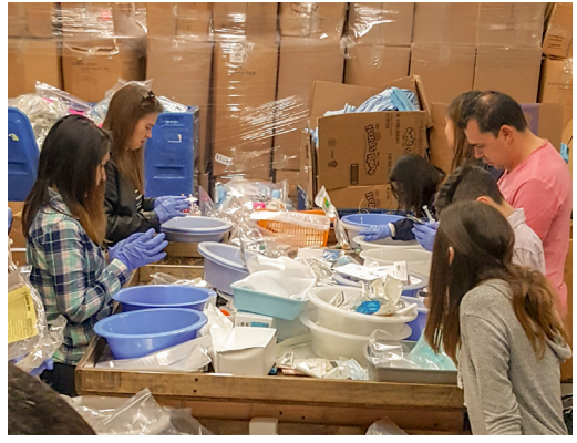
MSK staff volunteers sort thousands of supplies to support health initiatives abroad

MSK took additional steps in support of ongoing relief efforts, responding to the unfolding humanitarian crises in the wake of natural disasters that hit the southern United States, Mexico, Puerto Rico, and a number of Caribbean islands in 2017. MSK offered its health professional resources to consult with the Greater New York Hospital Association (GNYHA) and New York State Department of Health team to Puerto Rico. MSK also prepared and donated a shipment of oncology drugs for GNYHA and AFYA to deliver to doctors who were treating cancer patients in affected areas.