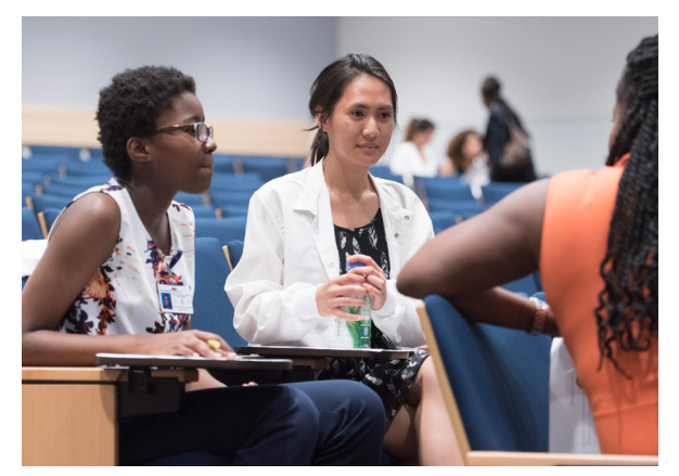
Supporting careers in medicine among minority and female medical students

The CME program sponsored numerous activities to address unmet needs in diverse communities, including a seminar for healthcare professionals titled "The LGBT Health Workforce Conference 2017." This one-day conference featured the country's leading researchers, clinicians, survivors, advocates, and policy experts on cancer in lesbian, gay, bisexual, transgender, and queer (LGBTQ) communities. Topics covered included barriers to care, tobacco and cancer, risk behaviors among LGBTQ youth, transgender people and cancer, human papillomavirus and vaccination, HIV and non-AIDS-defining cancers, breast cancer, survivorship challenges, and creating a welcoming environment.