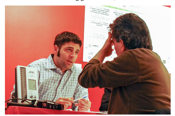
Educating members of the Mexican-American community during Binational Health Week

participants' eligibility for insurance coverage, and made 40 referrals for screening. In 2018, we will continue to partner with the Mexican consulate and our community-based and healthcare partner organizations to serve the Mexican community. Our goal is to increase the utilization of breast and colorectal cancer early-detection services by Mexican women and men by educating a total of 200 participants about breast and colorectal cancer and by directing 25 eligible women and men into screening. Additionally, we will provide information and screening services to more than 800 participants.