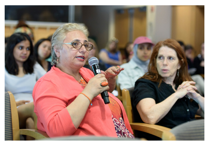
Immigrant Health and Cancer Disparities Conference

The Immigrant Health and Cancer Disparities Service (IHCD) coordinates a range of chronic disease prevention programs for underserved, immigrant, and multicultural populations. MSK increased the number of underserved individuals screened for cancer and cardiovascular disease through IHCD's community programs by 5 percent in 2017 and expect to increase this another 5 percent in 2018, in keeping with MSK's goals to address the New York State Department of Health's Prevention Agenda priorities. IHCD's programs, described below, are based in the community, and we partner with prominent community organizations: