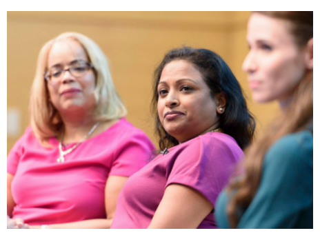
Free community lecture series

Our clinicians, researchers, nurses, and staff members are available to lecture on cancer-related topics to corporate, school, faithbased, and community-based organizations. Presentations in 2016 in our Regional Care Network areas were provided to numerous organizations, including the Cancer Support Community, Fellowship Village, and Somerset County Court House in New Jersey; and Ahavat Shalom of Great Neck, Central Islip High School, Deer Park High School, Families United in Health, Freeport Recreation Center, Gilda's Club of Westchester, Mather Hospital, and the New York Institute of Beauty in New York.