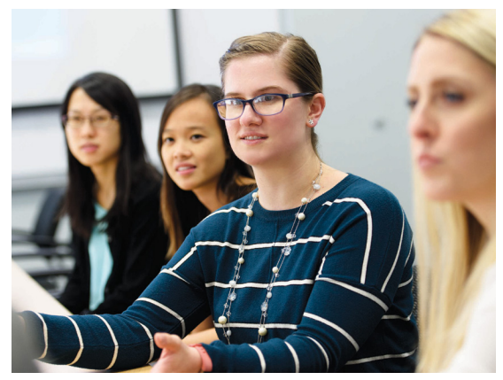
Specialty residency programs for pharmacists seeking careers in oncology

BECH plays a pivotal role in training students and young adults in the community to help direct their career growth. In 2017, BECH hosted ten college students with health or science majors and two mentor advisers from the Manhattan chapter of the National