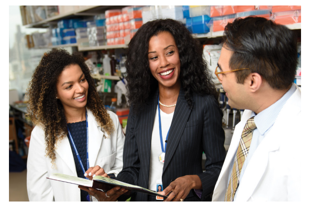
Summer Student Fellowship Program funds participation for underrepresented minority medical students

In 2016, more than 8,000 participants registered for continuing medical education (CME) courses at MSK to enhance their professional knowledge, stimulate new research ideas, and learn about ways to improve patient care and treatment outcomes.