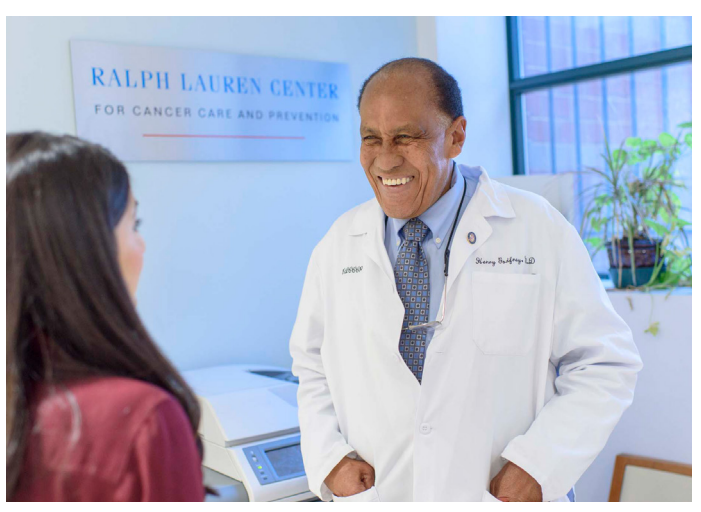
Cancer patient navigation and addressing health disparities in Harlem

The Ralph Lauren Center for Cancer Care (RLC), a New York State Article 28 Certified Diagnostic and Treatment Center, receives support from MSK to provide compassionate cancer diagnosis, prevention, and treatment services to all. Located in Harlem, the RLC further seeks to address the health disparities of increased death from cancer and other chronic diseases experienced by African Americans, Hispanics, and other racial and ethnic minorities; individuals of low income; and those without adequate health insurance. At the heart of its work is a patient care navigation model through which the RLC delivers a comprehensive, personalized approach to care.