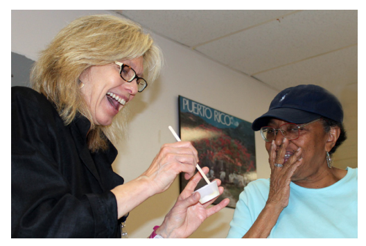
Cancer education also includes integrative medicine such as aromatherapy, acupuncture and massage therapy

In 2018, the initiative will continue its partnership with RAICES Senior Center and scale to new community partners in our target area.