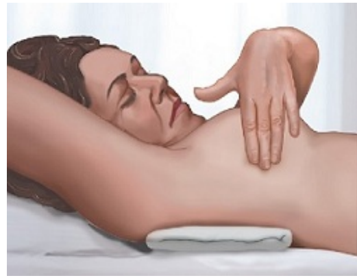
Figure 4. Breast self-exam while lying down

You'll need to use 3 different levels of pressure. Use all 3 pressure levels on each spot to feel the breast tissue before moving on to the next. If you're not sure how hard to press, talk with your doctor or nurse.