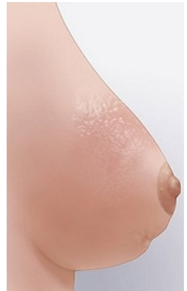
Figure 2. Breast with redness and dimpling