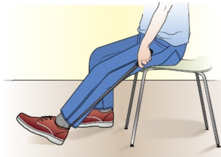
Figure 2. Using a shoe horn

If you have a hard time putting on or taking off shoes because your feet are swollen: